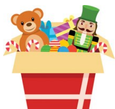
TABLE TOP SALE

Our final session for this term will take place on Wednesday 20th December and we will be back again, raring to go on Monday 8th January 2018 .